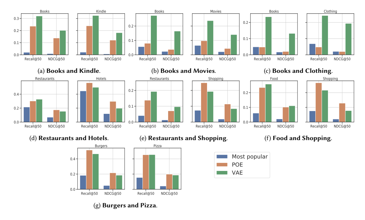
Fig. 2. Performance of the POE model on the domain-specific cold-start problem.

a missing domain and still evaluate the model by using users with known history on both domains.